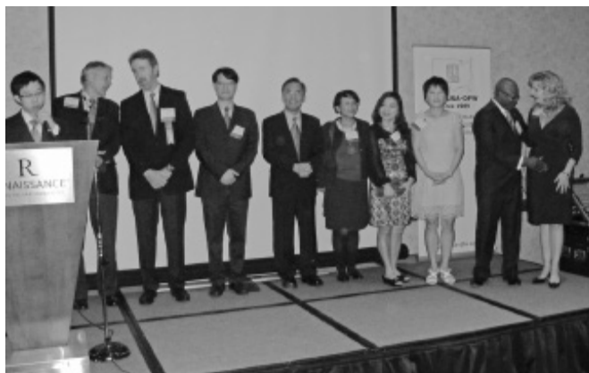
▲ welcoming VIP guests at the reception

This year, eighteen outstanding high school students received the Young Achiever Award. These young people are a perfect example of our next generation of successful Asian Americans. We applaud the winners that inspire us all.